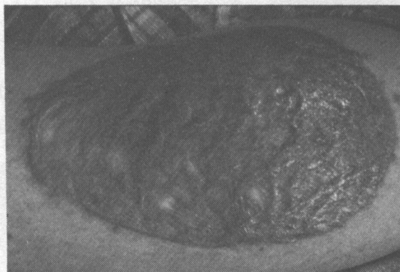
Photo of skin graft 6 months after.

Unfortunately documentation is difficult without a clinical camera and also because most girls are only in Winlaton for six to eight weeks. It would be desirable to have a six month follow up photograph.