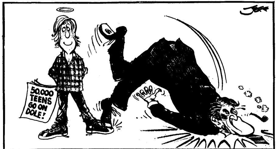
THE AWKWARD YEARS!