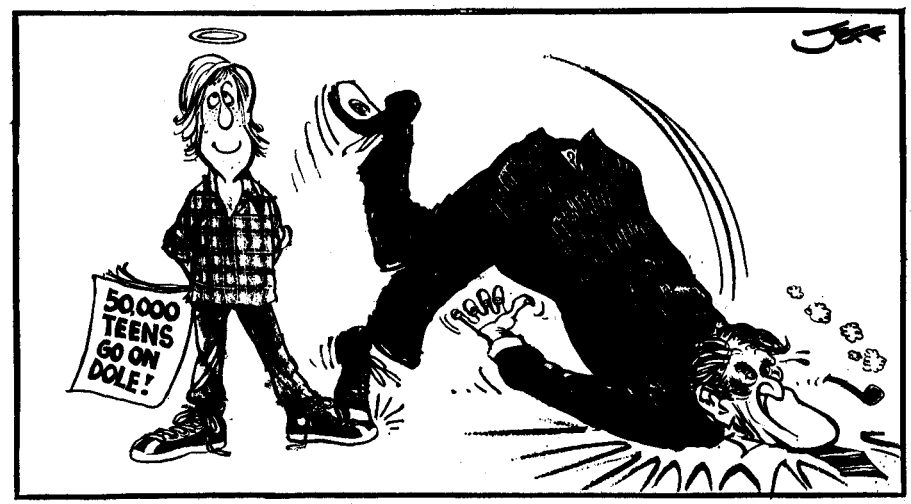
THE AWKWARD YEARS!