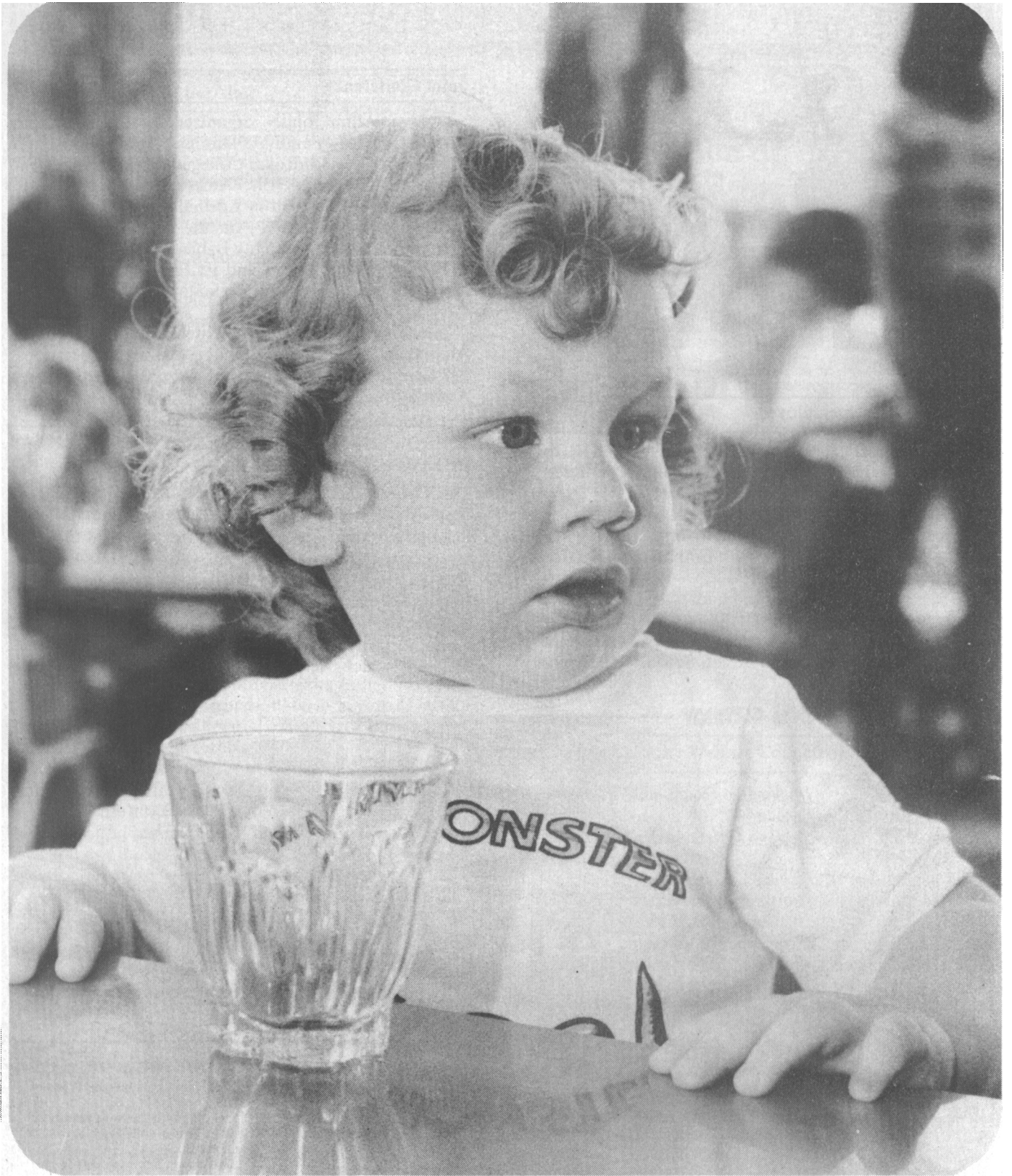
"Didn't touch the sides"