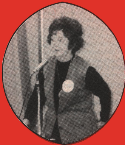
Mrs. Joan Child — Conference Chairman

The Proceedings of the Victorian Child Care Conference.