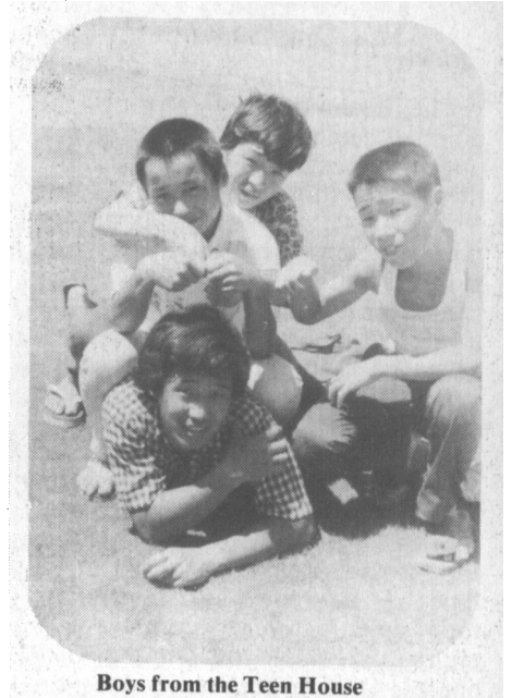
Boys from the Teen House

For those who worked at some institution for 3 years and age above 25, the Welfare Fund offers 1,200,000 yen ($3220) for overseas study.