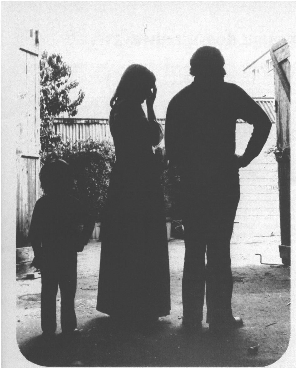
Man, woman and child