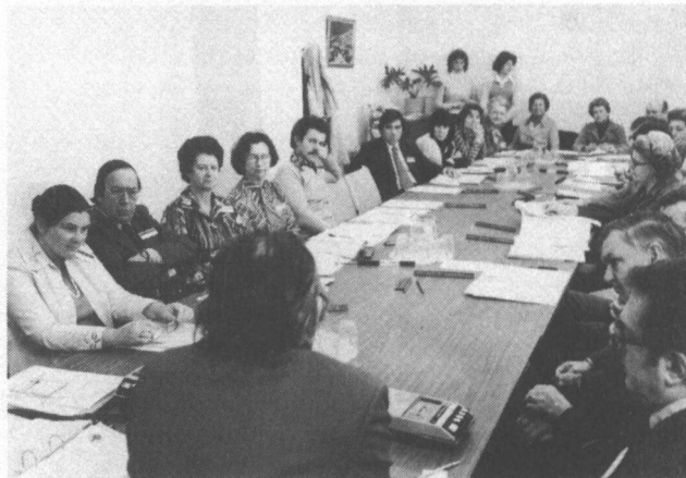
Inaugural meeting of the IYC National Committee of Non-Government Organisations, held in Sydney on June 12.