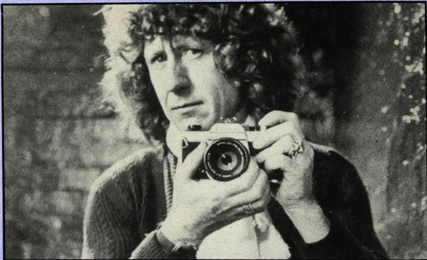
Top fashion and advertising photographer Peter Gough, reflecting on the new Pentax K1000.