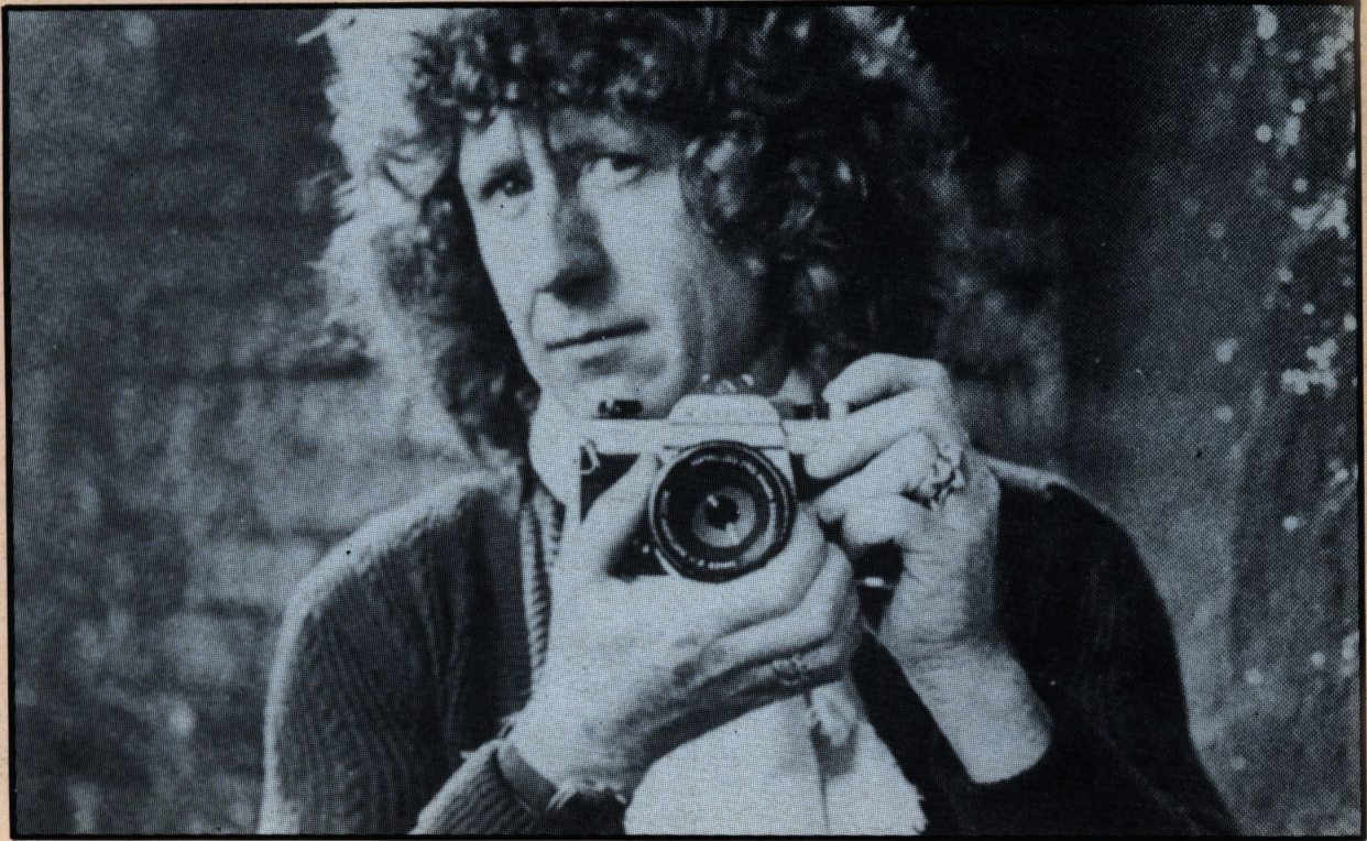
Top fashion and advertising photographer Peter Gough, reflecting on the new Pentax K1000.